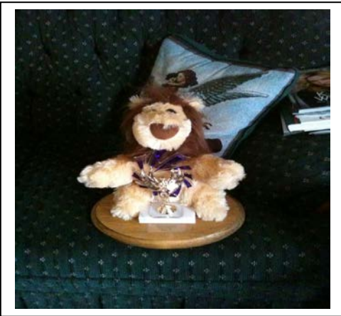
Doesn't Bud look happy??