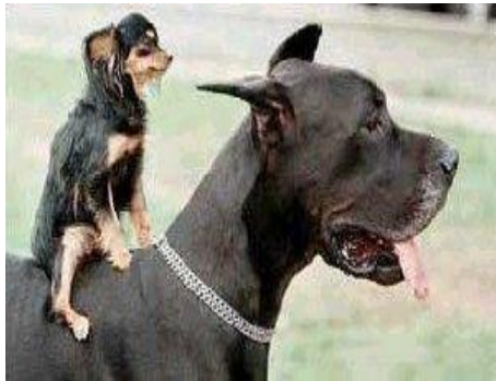
“When did they say they were going to have the air fixed in my car?”

Remember - - All articles or information for the newsletter should be sent to the editor, DG Hufferd, no later than the 20 th of the month to be included in the next newsletter.